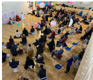
The Clear Mountain community meets in a school auditorium for weekly meditations

The aim of Clear Mountain Monastery is the founding of a Buddhist community. In Theravāda Buddhism and within the Early Buddhist Texts, the forest tradition represents a return to the simple way of life taught by the Buddha. Monastics aspire to live as the early disciples did: dwelling in the forest, studying the teachings, and devoting themselves to meditation. Monks, nuns, and laity exist in a relationship of mutual generosity, in which they support one another on the Buddha's path towards complete liberation of the heart — Nibbāna .