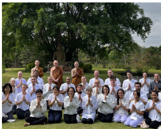
Pilgrims from Clear Mountain's community visit Ajahn Jayasaro in Thailand